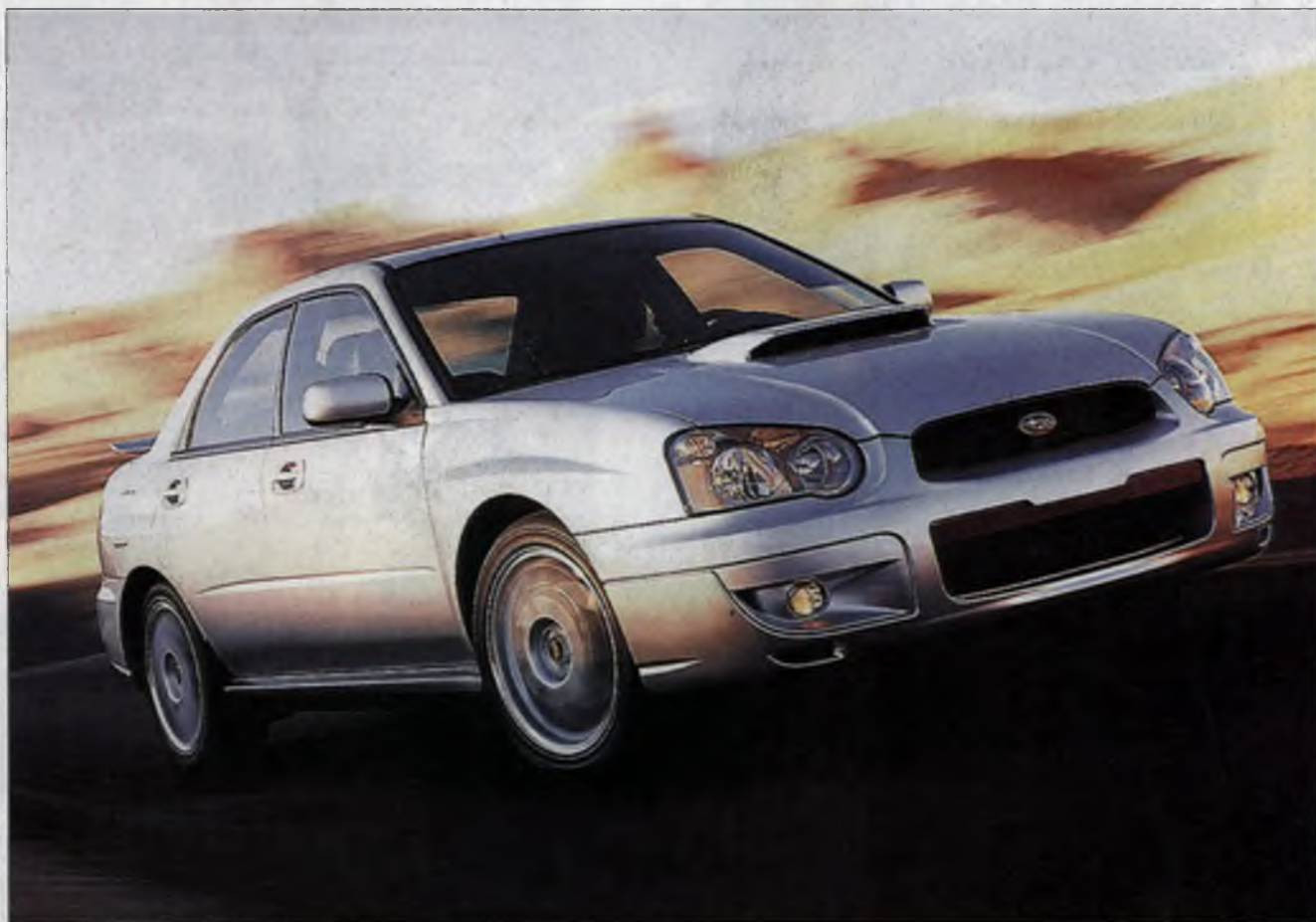
An exciting new body enhances the already racy looks of the Subaru WRX for 2004.

Both Impreza WRX models come equipped with standard 16 x 6.5-inch alloy wheels with 205/55 R16 Bridgestone Potenza RE92 tires. Subaru dealers can offer available 17 x 7-inch BBS forged aluminum alloy wheels or 17-inch Subaru 5-spoke aluminum alloy wheels with recommended 215/45 R17 tires.