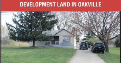
DEVELOPMENT LAND IN OAKVILLE

9371 TRAFALGAR RD, HALTON HILLS 401 HWY TO TRAFALGAR RD NORTH Main floor 3000 sqft approx. 4 + 2 bedroom bungalow in between Milton & Georgetown with separate entrance 2 bdrm apartment, country side view with no homes behind, updated kitchen w/ center island, geothermal furnace, 10 car circular driveway. $649,000.