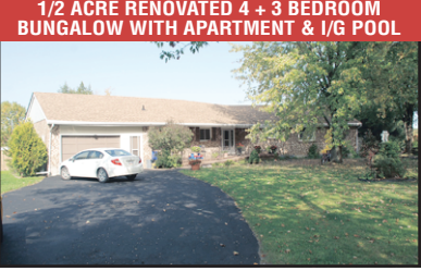
1/2 ACRE RENOVATED 4 + 3 BEDROOM BUNGALOW WITH APARTMENT & I/G POOL

Attention Investors & Developers! Rare properties for development! One property currently has a 3 bedroom bungalow with a detached garage and on septic & well. Call for showing.