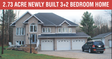
2.73 ACRE NEWLY BUILT 3+2 BEDROOM HOME

840 LOWER BASE LINE, MILTON Great central Location in Milton south bordering Oakville & Mississauga to build dream home & have a future investment property bordering a 40 acre lot owned by Mattamy Builders. Backs onto Sixteen Mile Creek. Call for showing. $1,799,999.