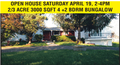
OPEN HOUSE SATURDAY APRIL 19, 2-4PM 2/3 ACRE 3000 SQFT 4 + 2 BDRM BUNGALOW

8465 FIFTH LINE, HALTON HILLS Located on the edge of Milton just north of Steeles. 3 Bedroom Brick Home with master bedroom & modern ensuite on main level with 80 ft x 40 ft. Detached Garage/Workshop for 10 trucks/cars. Eat In Granite Tile Counter Kitchen, Hardwood flooring thru out, Updated vinyl windows. Call for showing. $969,000.