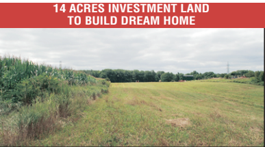
14 ACRES INVESTMENT LAND TO BUILD DREAM HOME

9803 FOURTH LINE, HALTON HILLS 6 mins to Milton city, backing onto green space. 2 bedrm in law suite with apartment. Inground 18'x36' pool, 1.5 car garage, 2nd driveway, new kitchen w/ travertine stone floor, hardwood main floor, newer vinyl windows, newer bathrms, freshly painted, natural gas furnace. Call for showing. $799,000.