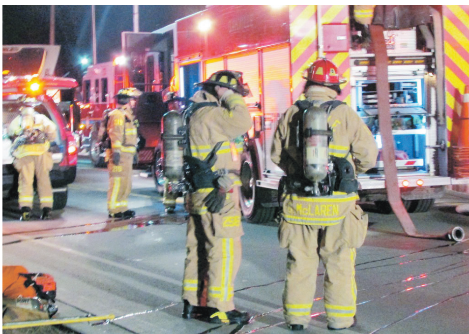
Oakville firefighters at the scene of a garage fire on Lakeshore Road West Saturday night. Crews arrived to find the garage engulfed in flames. Three people inside the home at the time were able to escape to safety and call 911. The fire was one of four that occurred in a 24-hour period last weekend in the west end of town.