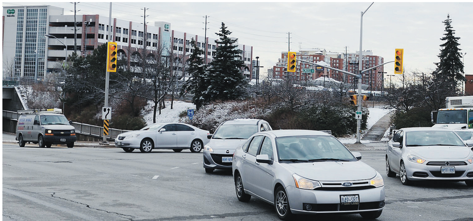
The corner of Trafalgar Road and Cross Avenue is one of the busiest in town. A big reason for that is its access to not only the major Trafalgar Road corridor, but also the Oakville GO Station where parking has consistently been increased, most recently with the addition of a new parking garage, seen in the background.

Connected to your community - $1.00 incl. tax