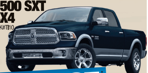
2013 RAM 1500 SXT 4X4 STK#T110