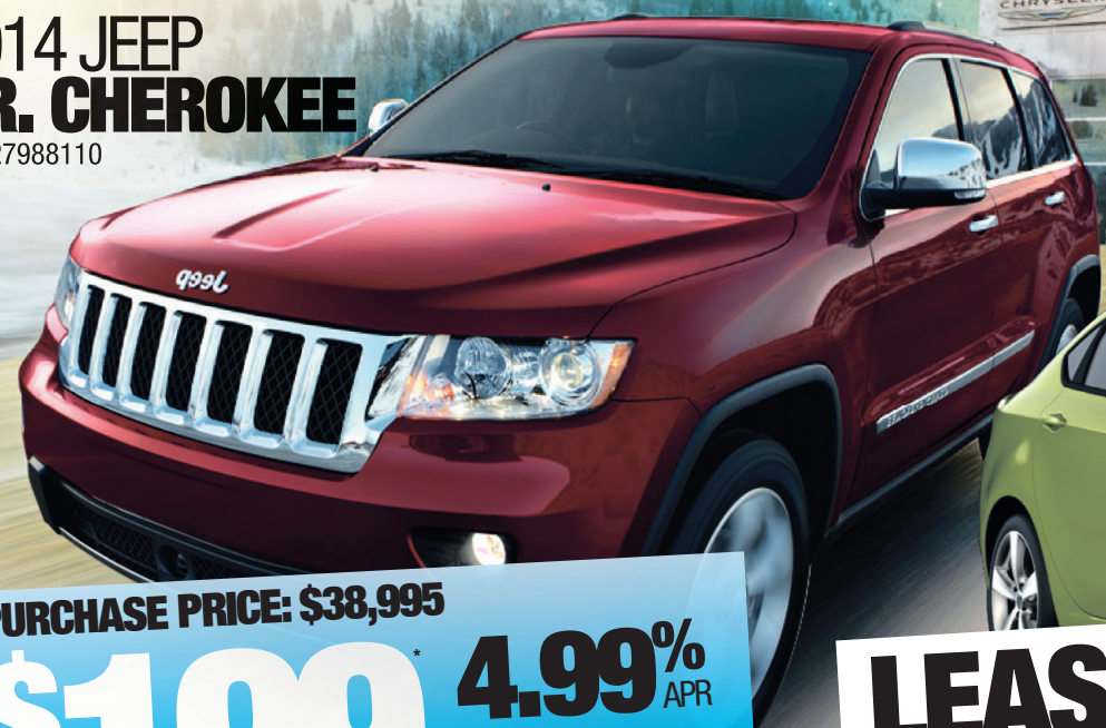
2014 JEEP GR. CHEROKEE STK#27988110

NEW Management! Same GREAT Service, Just BIGGER Selection AND LOWER PRICES!