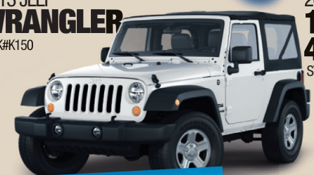
2013 JEEP WRANGLER STK#K150