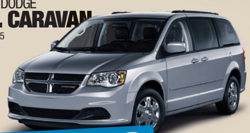
2013 DODGE GR. CARAVAN STK#G185