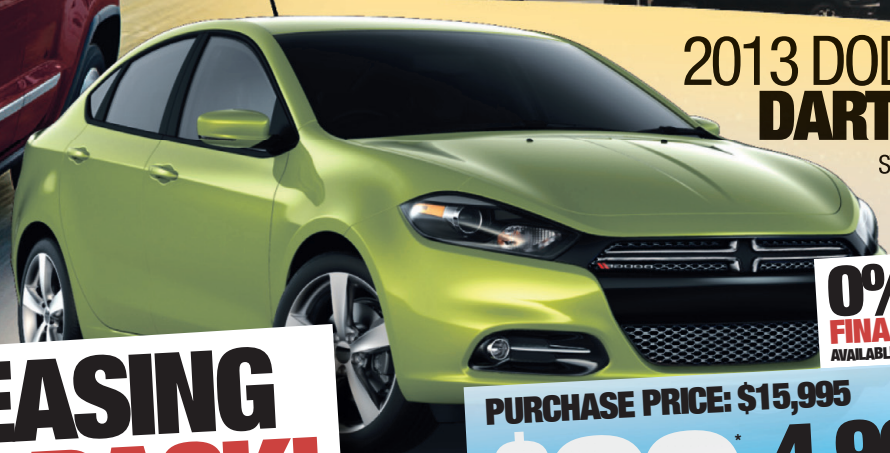
2013 DODGE DART SE STK#16720