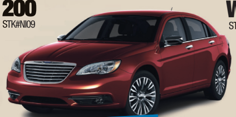
2013 CHRYSLER 200 STK#N109