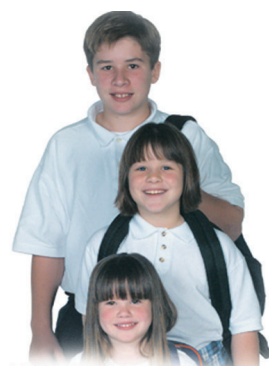
KIDS SPEAK OUT School News

The company started to grow very fast and after four years when Jobs was only 25 years old, he was worth more than $200 million.