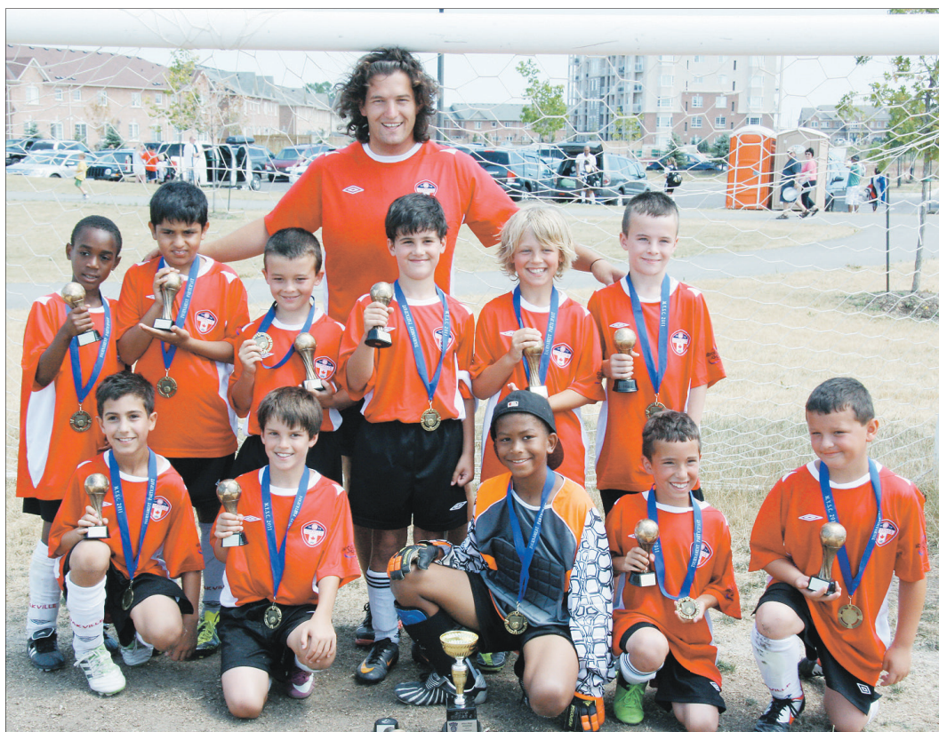
The Oakville Soccer Club's under-9 boys' A team won a tournament in Milton last weekend.