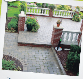
Decks & Patios