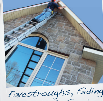
Eavestroughs, Siding Soffit & Fascia