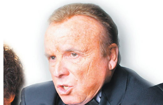
Ed Sullivan Show