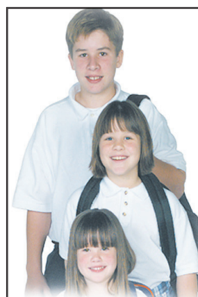
KIDS SPEAK OUT School News

If this is multiplied across many families, a