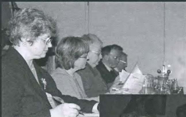
The Board of Directors contemplate important OLA member issues