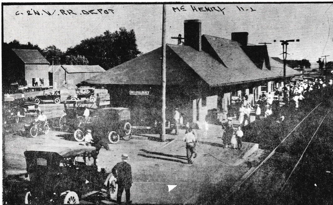
LOOKING EAST AT TRAIN SIDE OF McHENRY DE- POT. Photo taken many years ago.