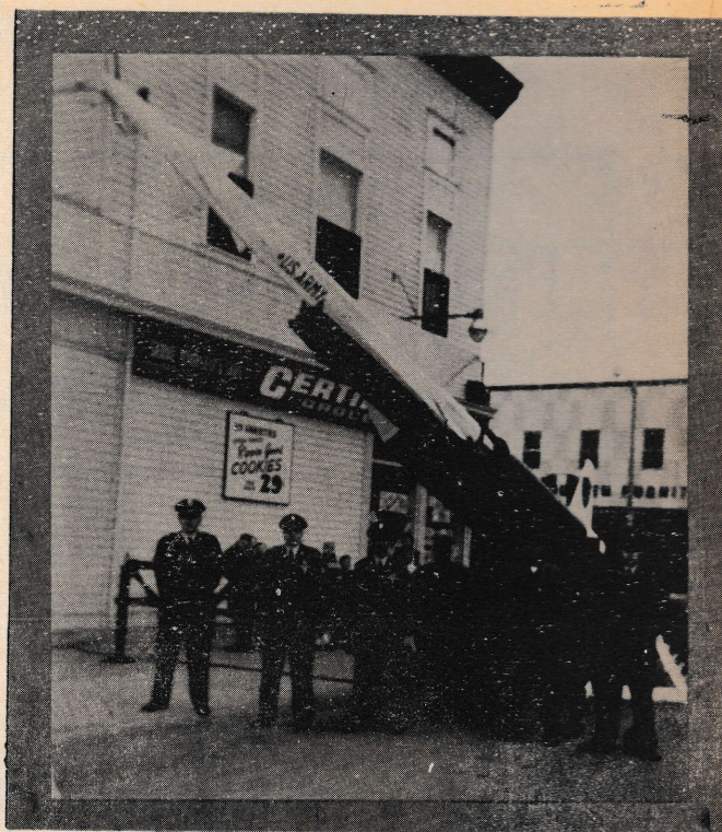
PICTURE SHOWS AJAX MISSILE DISPLAYED AND EXPLAINED AT THE CORNER OF ELM AND GREEN STREETS WITH CREW MANNING IT.

Compiled and Owned by ARTHUR J. STUHLFEIER