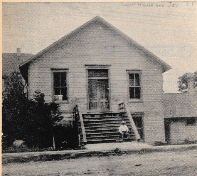
COURT HOUSE AND JAIL OF McHENRY TAKEN BEFORE 1907.