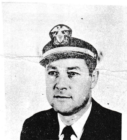
LT. CMDR. J. R. LEVESQUE

of transporting cargo and passengers. While at Roosevelt Roads Air Station, he was summoned to base operations which was under heavy military guard. He was fortunate enough to view the map of the Caribbean area which showed the placements of our security task force in those waters. There were also indications of