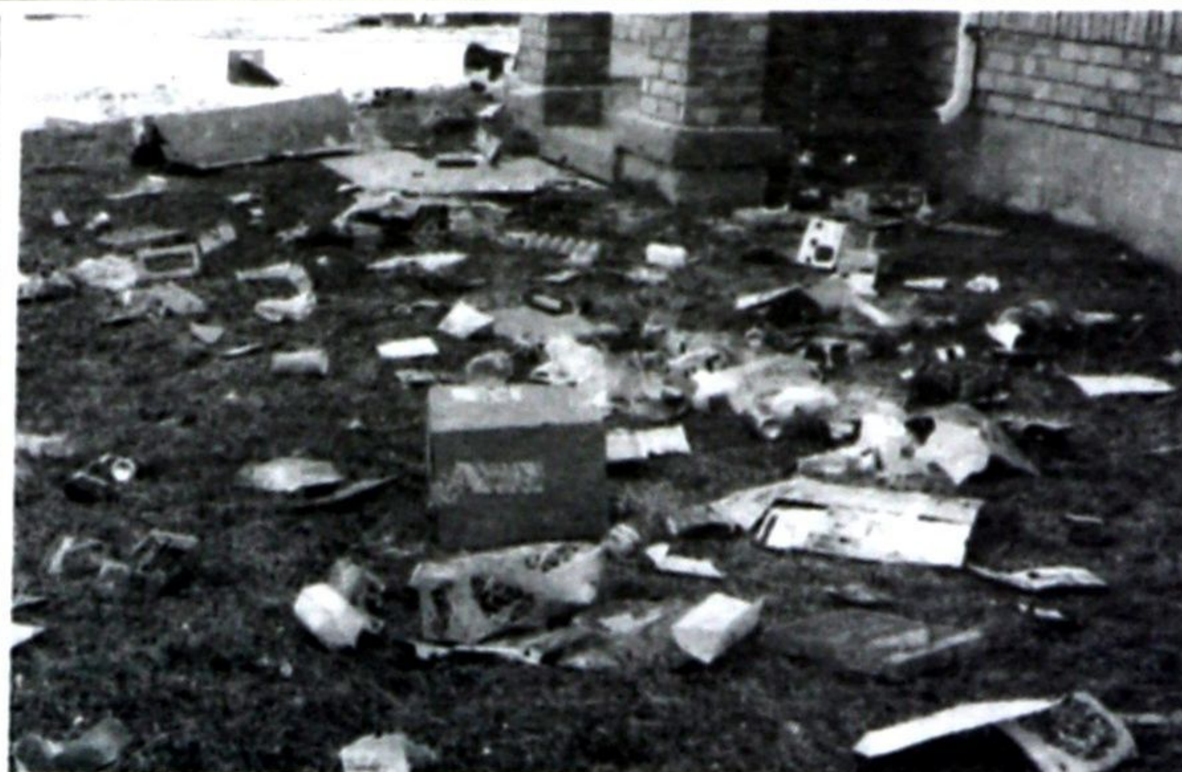
Recyclable materials settle on Lauren Fluder's Milton lawn after strong winds tipped her neighbours' blue bins last week.

may be exceptionally strong that bins with lids wouldn't prevent a mess. But this appears to be a re-occurring issue in our town — no matter how the wind blows.