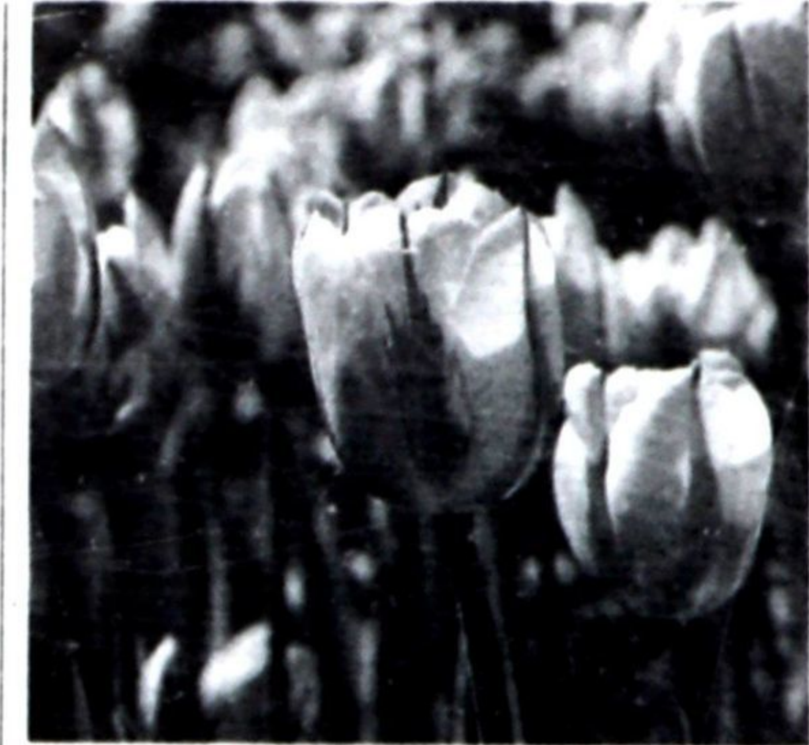
Canada 150 tulips are set to bloom between April and June. The commemorative tulips were created by the Dutch to celebrate our nation's milestone anniversary.

After the Second World War, Princess Juliana of the Netherlands presented Ottawa with 100,00 tulip bulbs as a token of friendship for Canada's help during the war.