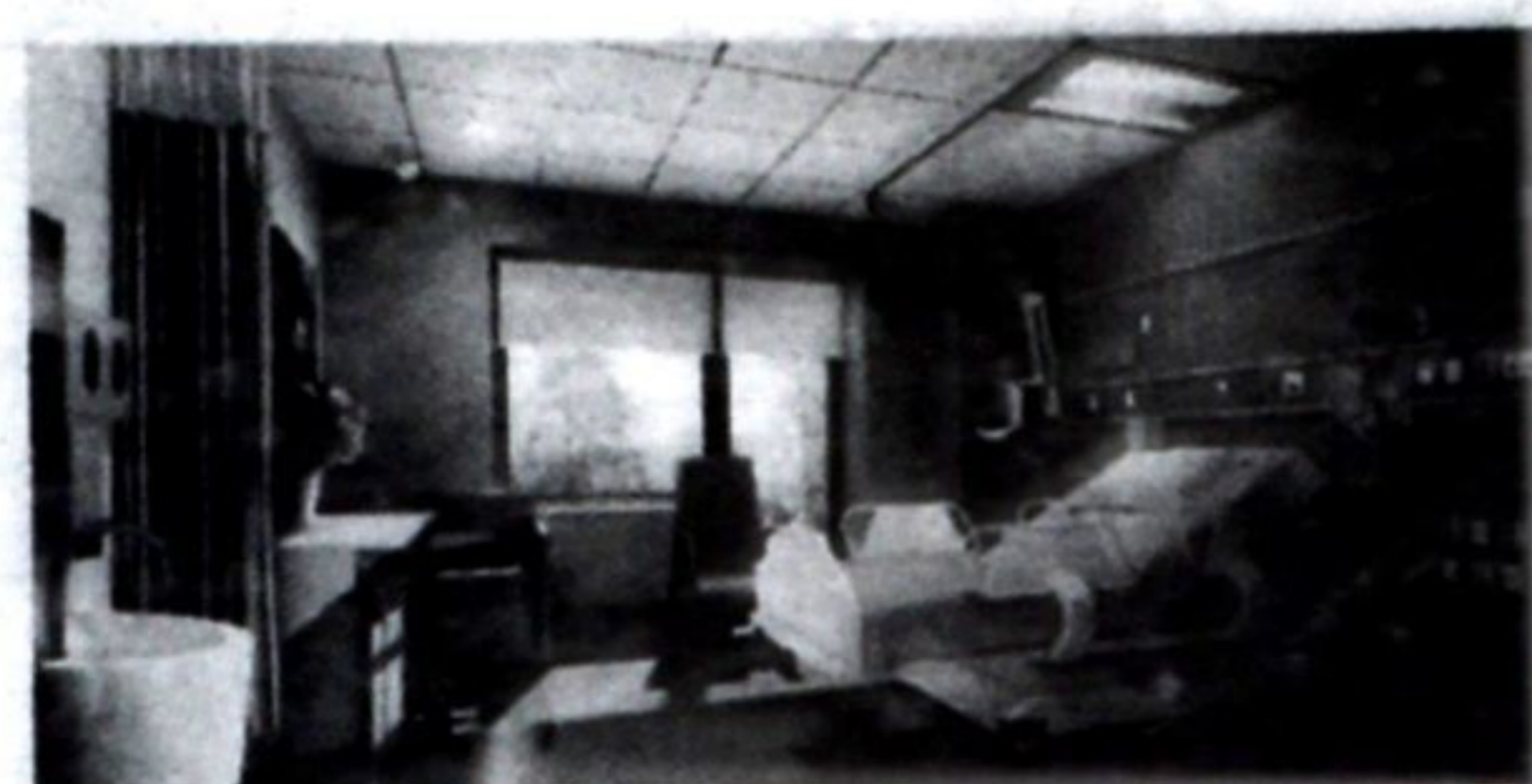
Typical single patient room