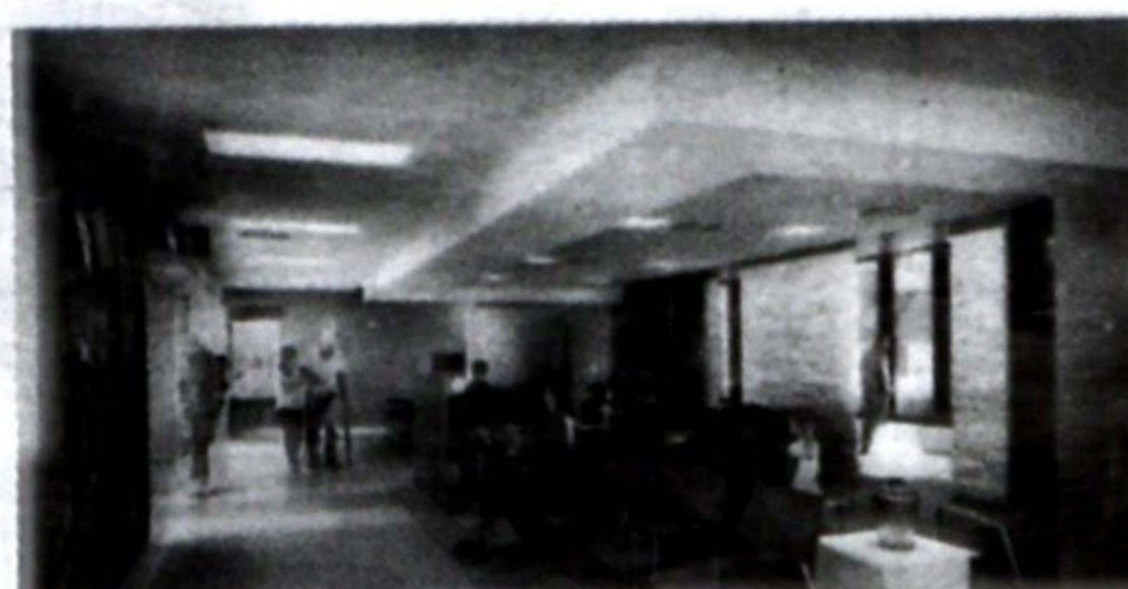
Diagnostic Imaging waiting room