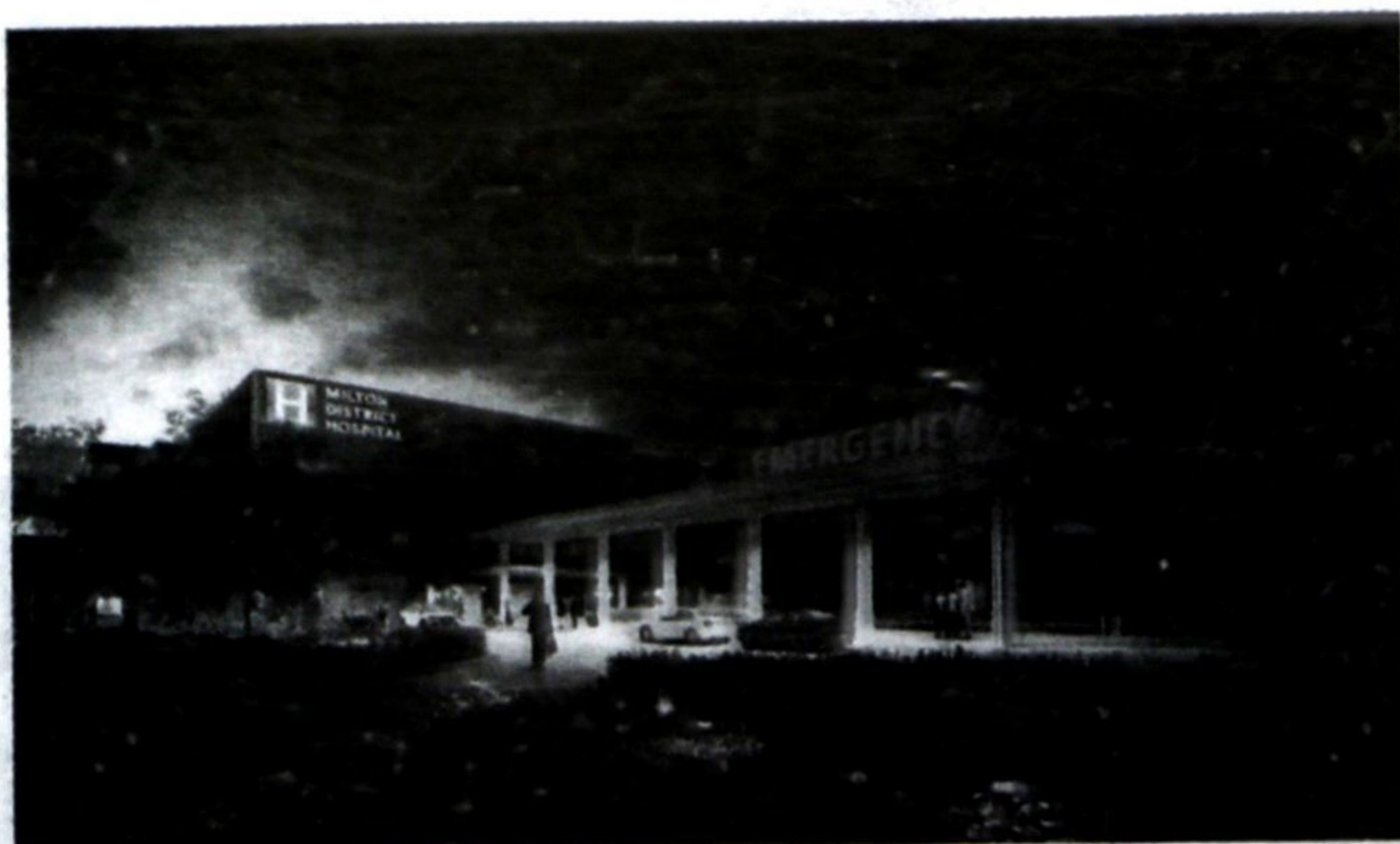
Emergency Department Entrance

As construction of the Milton District Hospital (MDH) expansion continues to progress rapidly toward substantial completion, architectural renderings of the new expansion help us to imagine how the new spaces will look and feel. The 330,000 sq. ft. expansion will combine innovative architecture and the latest in technology to deliver high quality patient and family-centred care and exemplary patient experiences, always .