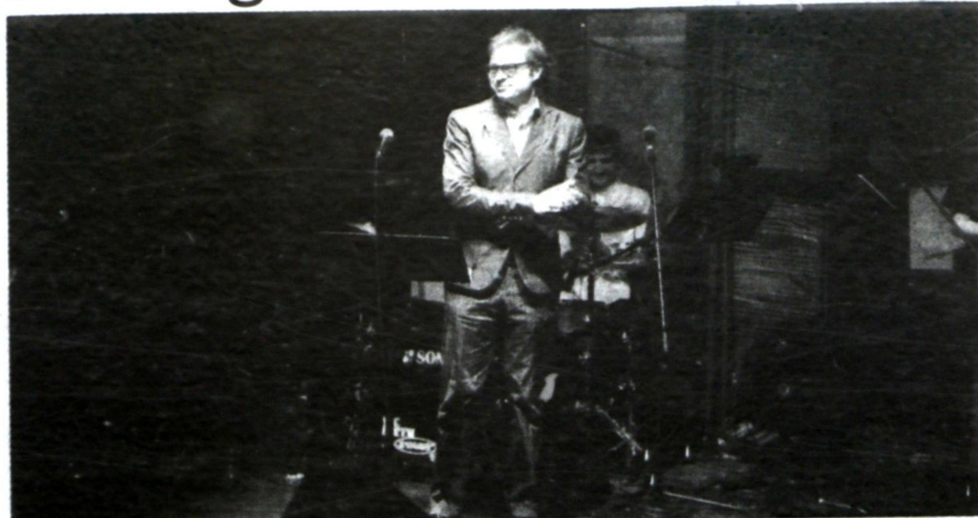
Steven Page, pictured at a 2009 benefit concert for schools, will perform in Milton Saturday.

and distinctive voices in music today. Page is a critically-acclaimed solo artist, following 20 years of success as one of the founding members of the Barenaked Ladies, which has sold more than 12 million albums worldwide.