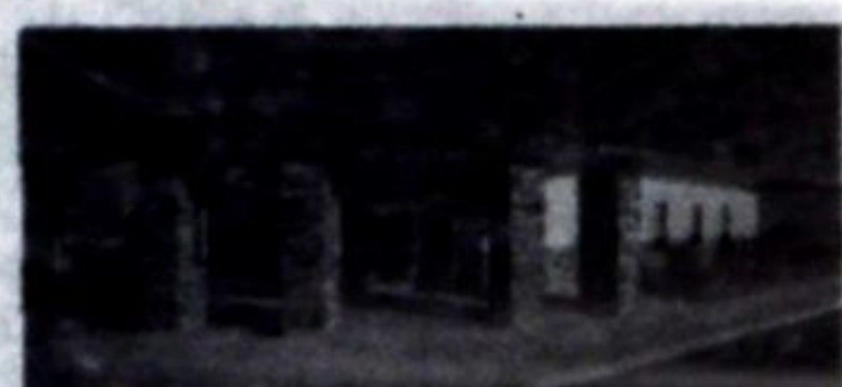
TEATRO CONFERENCE & EVENT CENTRE