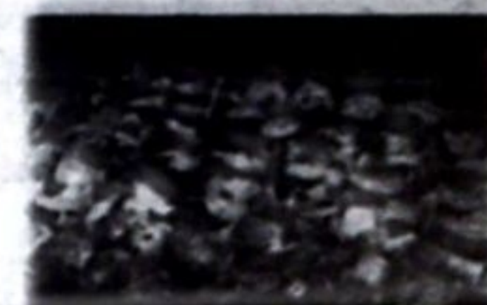
THE RED BBQ Co.