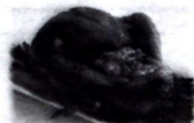
SILVER THYME EVENTS & CATERING