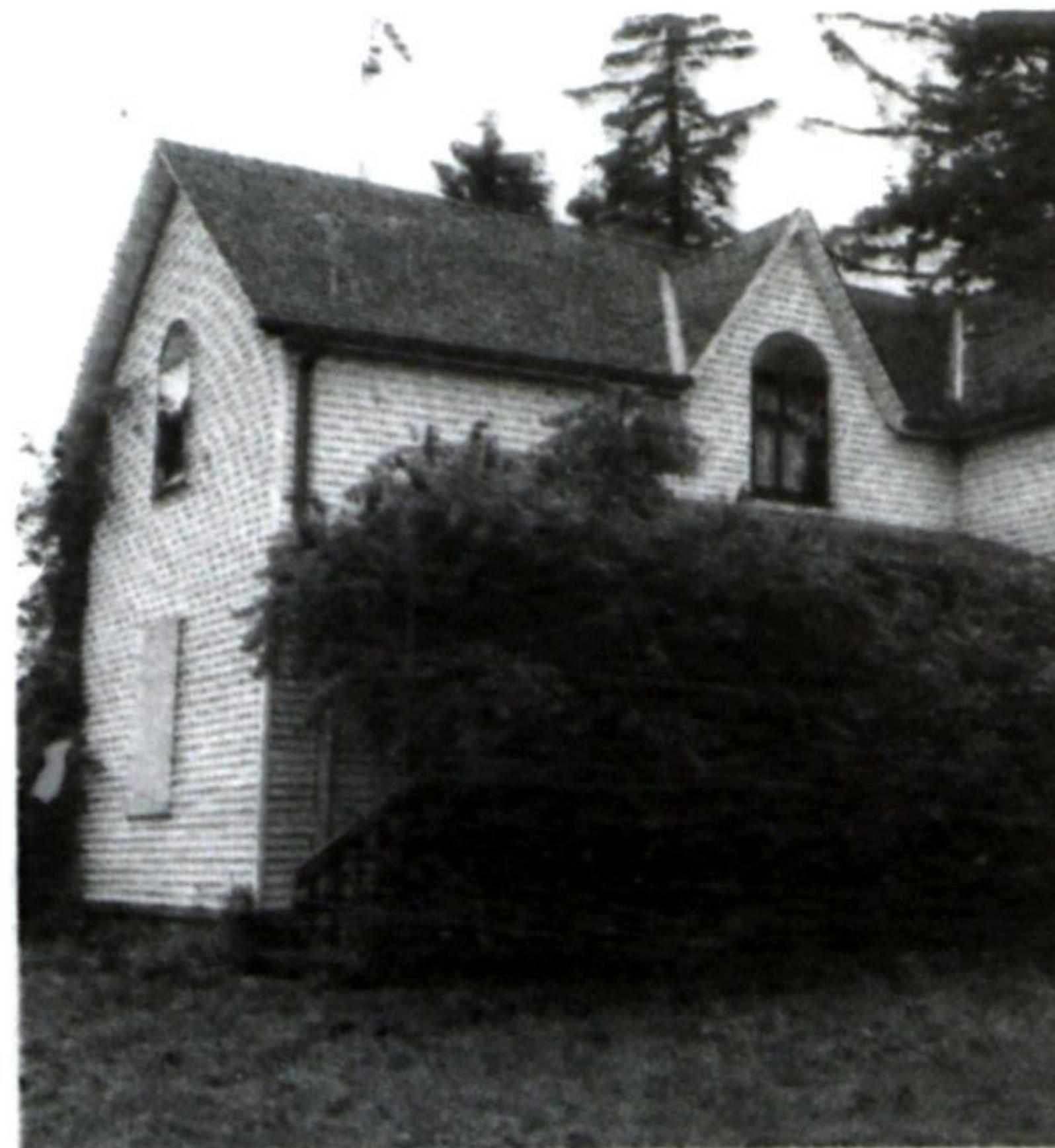
Committee of the Whole members discussed options to protect a home with heritage features from further falling into a state of disrepair. The house is located at 94 Peru Rd.

The home can still be altered or moved after receiving a designation, but both must re-