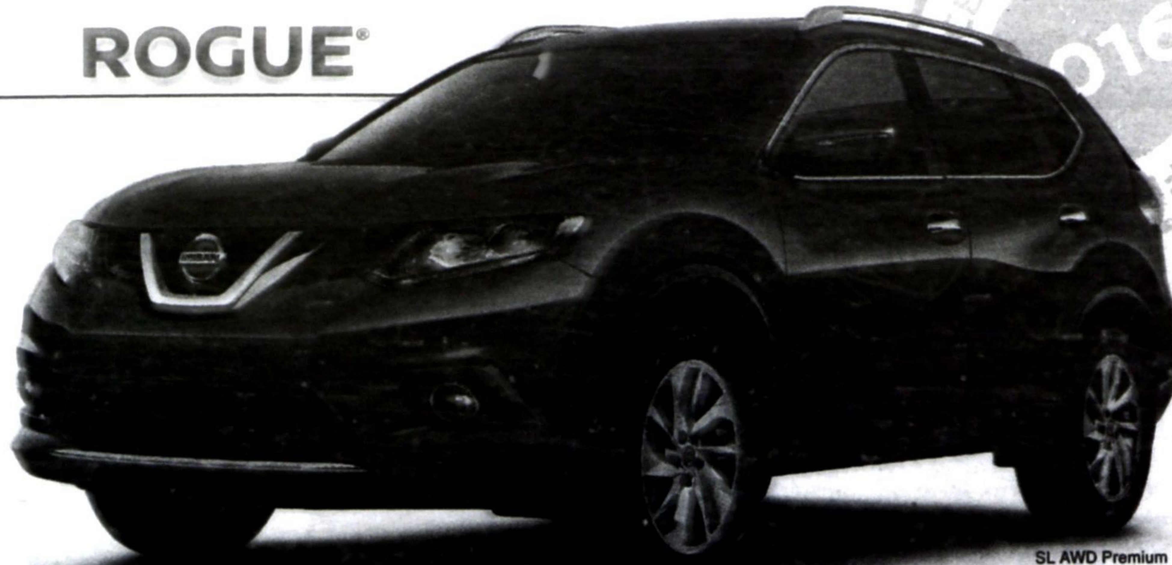
SL AWD Premium model shown*

STANDARD RATE FINANCE CASH UP TO $5,000 + ON 2016 ROGUE SL PREMIUM*