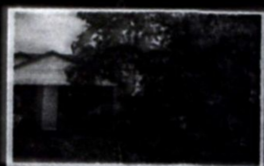
3 Bdrm Semi-Detached 704 Sylvan Dr.