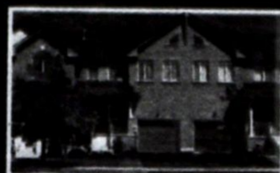
$525,000 371 Bussel Cres.