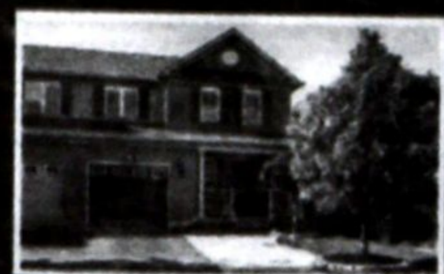
$569,900 913 McNair Circle