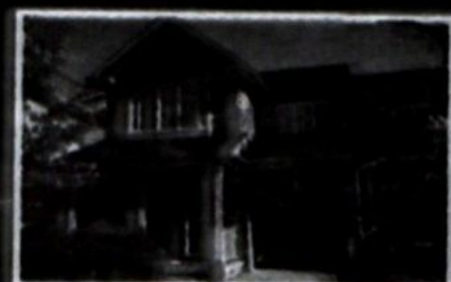
SOLD 641 Sellers Path