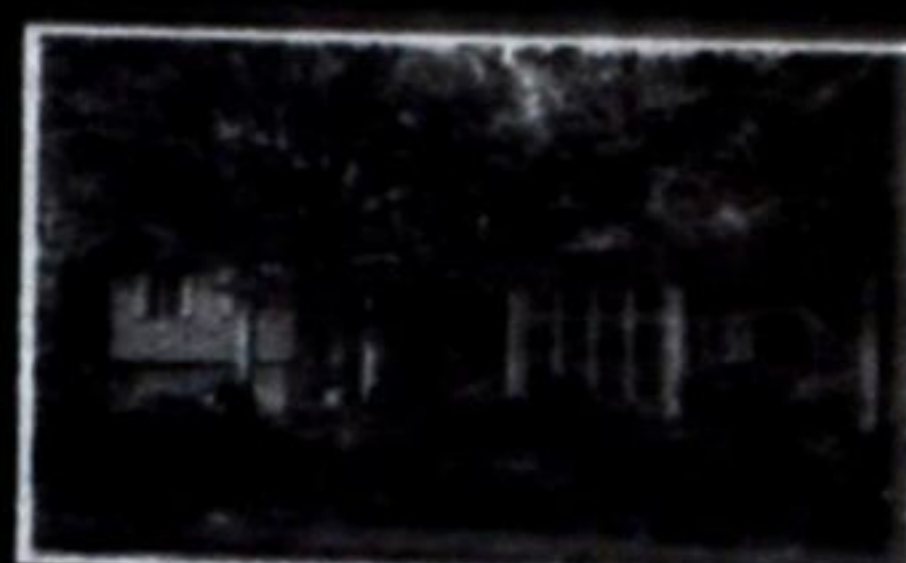
$839,000 1/1 Jessie Ave.