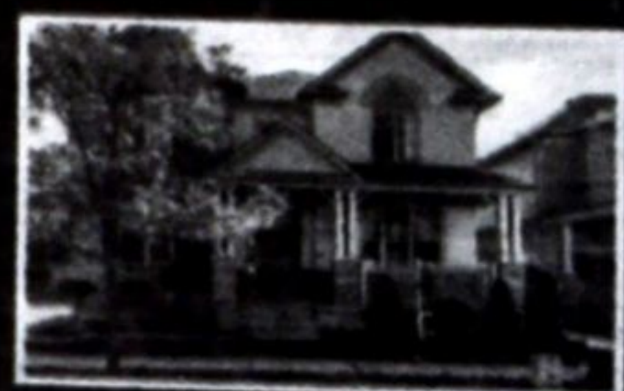
$1,099,000 1255 Winter Cres.