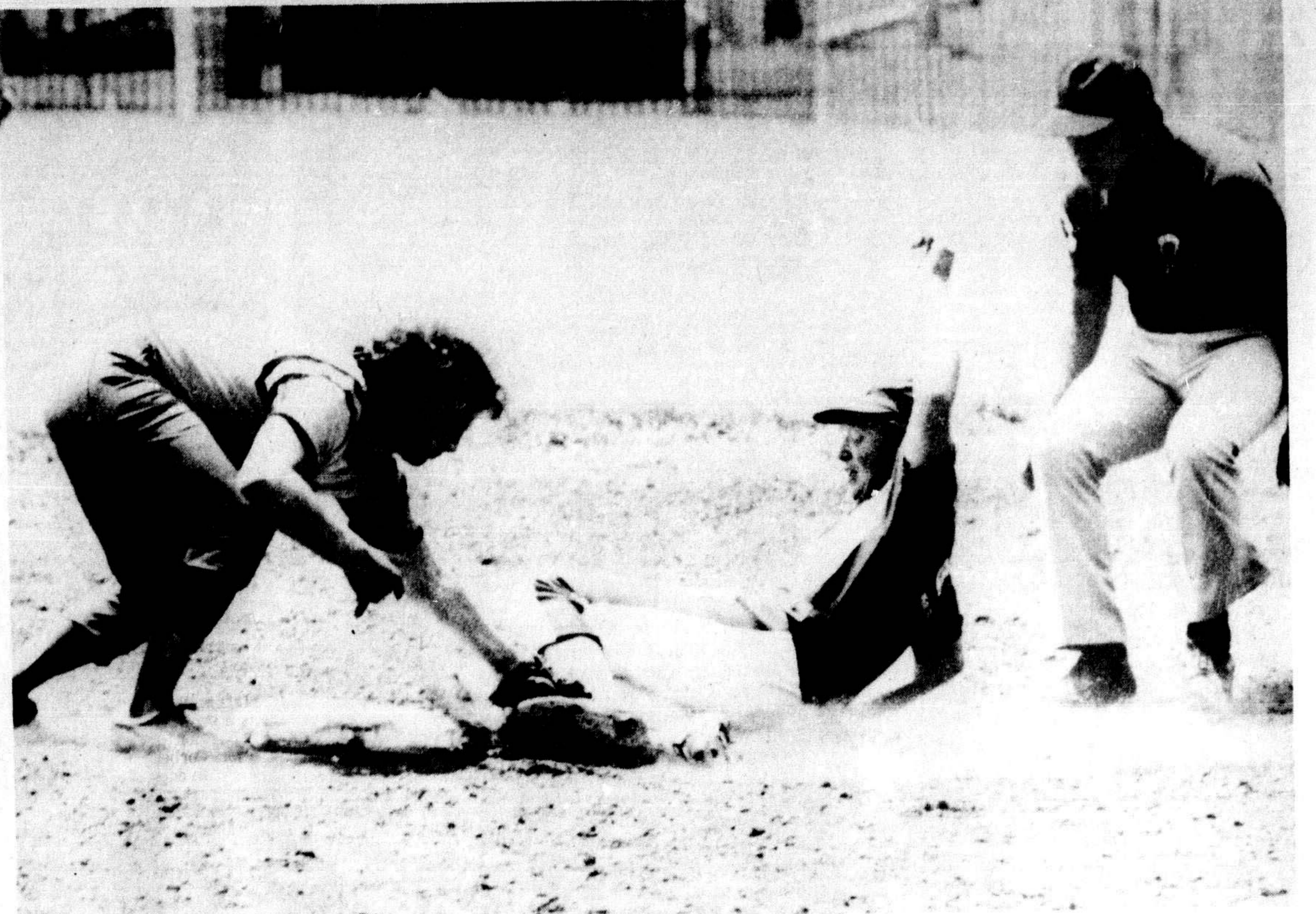
OUT. A Palermo baserunner gets caught at second trying to steal—with the umpire leaning over the base to make the call. This Malton-Palermo game was part of the action at the eight team Palermo softball tournament over the weekend.

Campbellville travels to Mississauga for a Friday night game and will entertain Waterdown in Campbellville 2:30 Sunday.