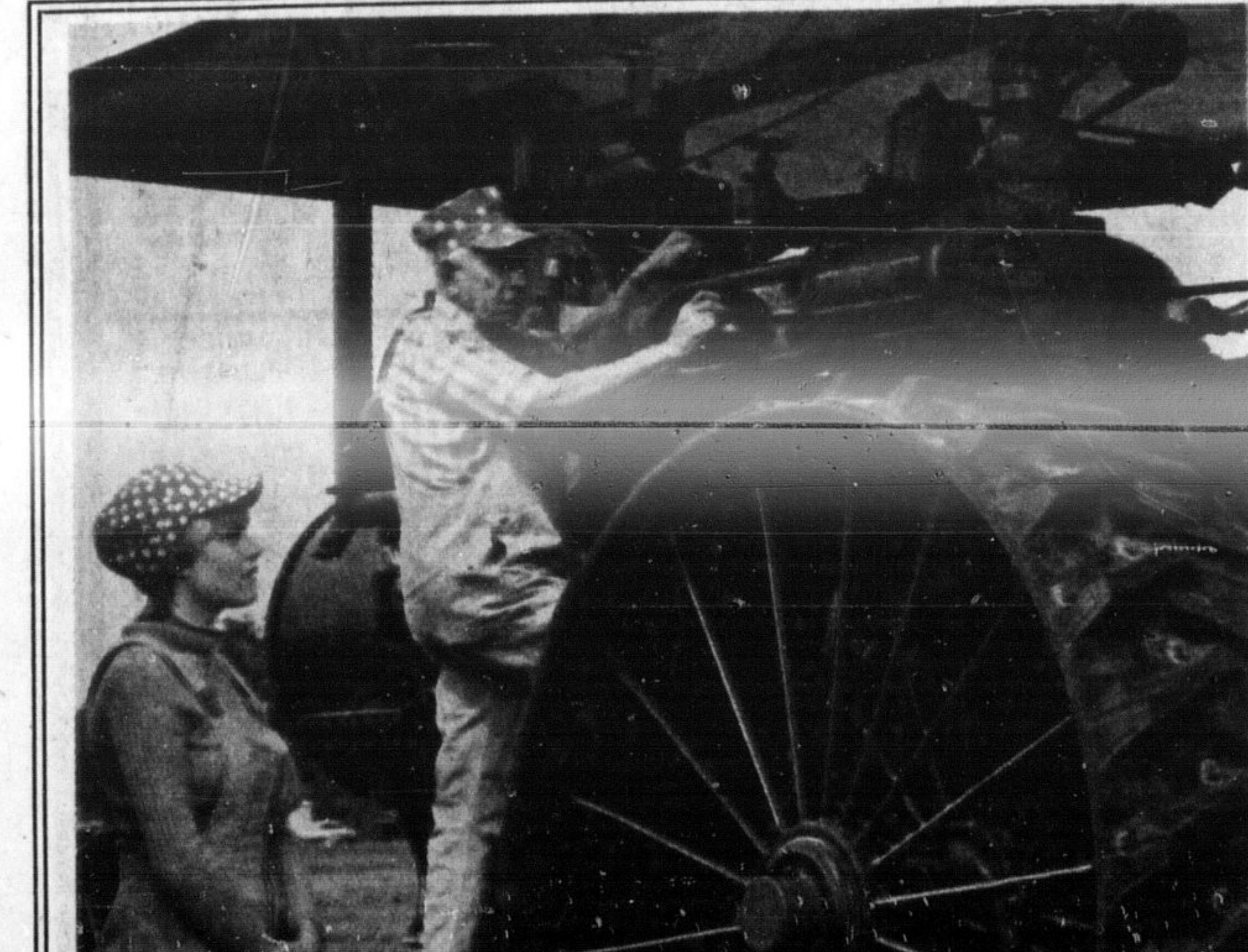
The Champion this week has the Steam-Era book inside which tells you all about this weekend's steam extravaganza.