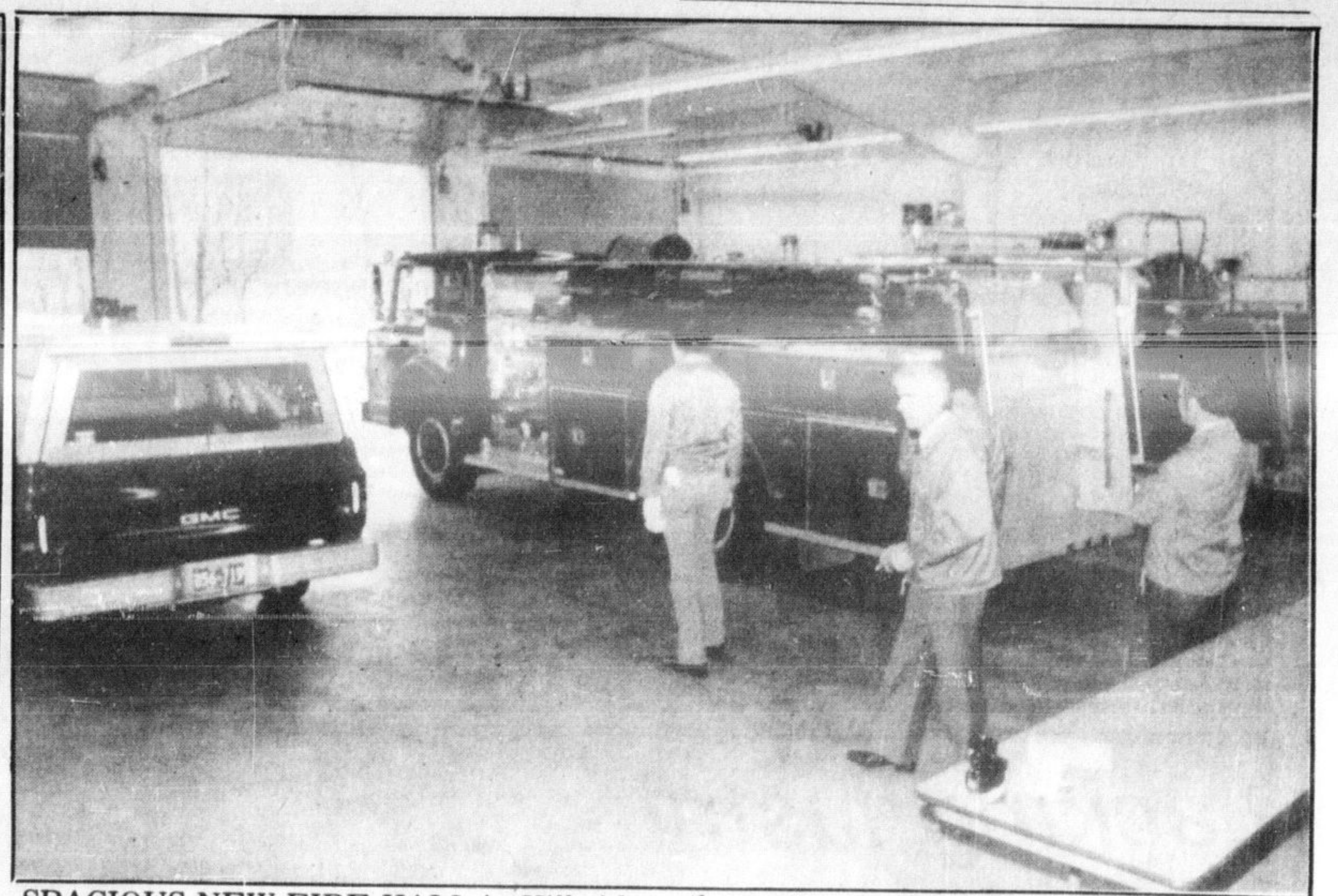
SPACIOUS NEW FIRE HALL in Kilbride is designed to house the two fire pumps and emergency van. Guests toured it and the accompanying office, lounge and coat room during Friday's official opening and Sunday's open house.