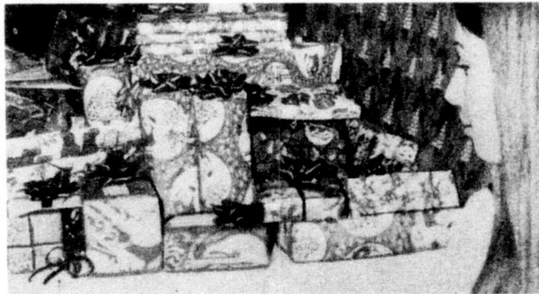
TRADITIONAL...Gift giving at Christmas is an indispensable part of our holiday celebration. As the Three Wise Men brought tokens of their respect to the Christ Child at Bethlehem, so do we offer our tokens of love and friendship to family and friends.

Hydro does not anticipate problems in meeting power needs this winter. However, electric power consumption grows each year, and in order to keep these increases moderate, Hydro asks consumers to cut back on their use of electrical energy wherever they can.