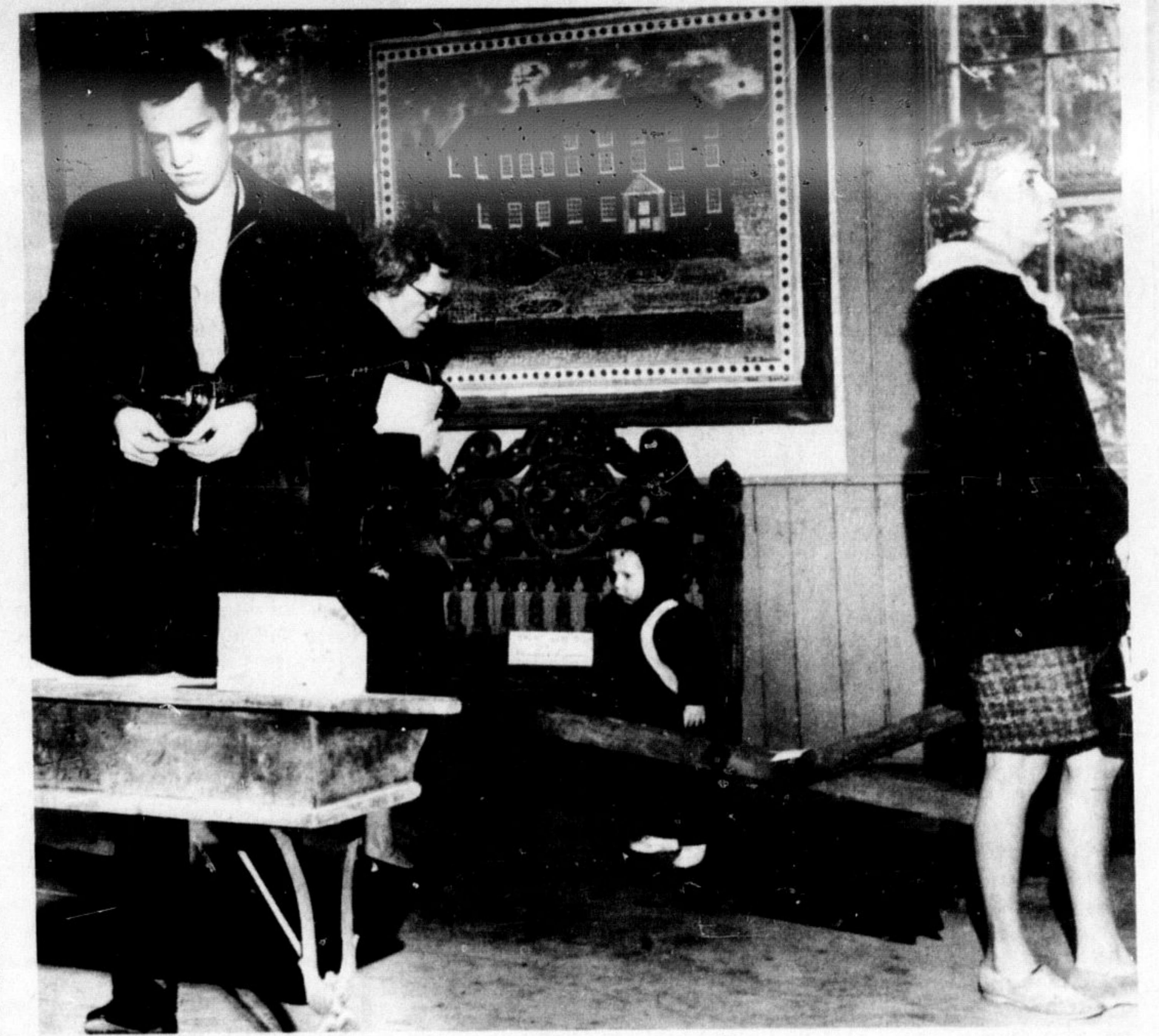
OBJECTS IN ONE of the restored school rooms of the Rockwood Academy are examined by visitors over the weekend. Included in the display were desks and ink wells used by stu-

His laborious work on the old Academy is gradually bringing back to the grey stone building the elegance