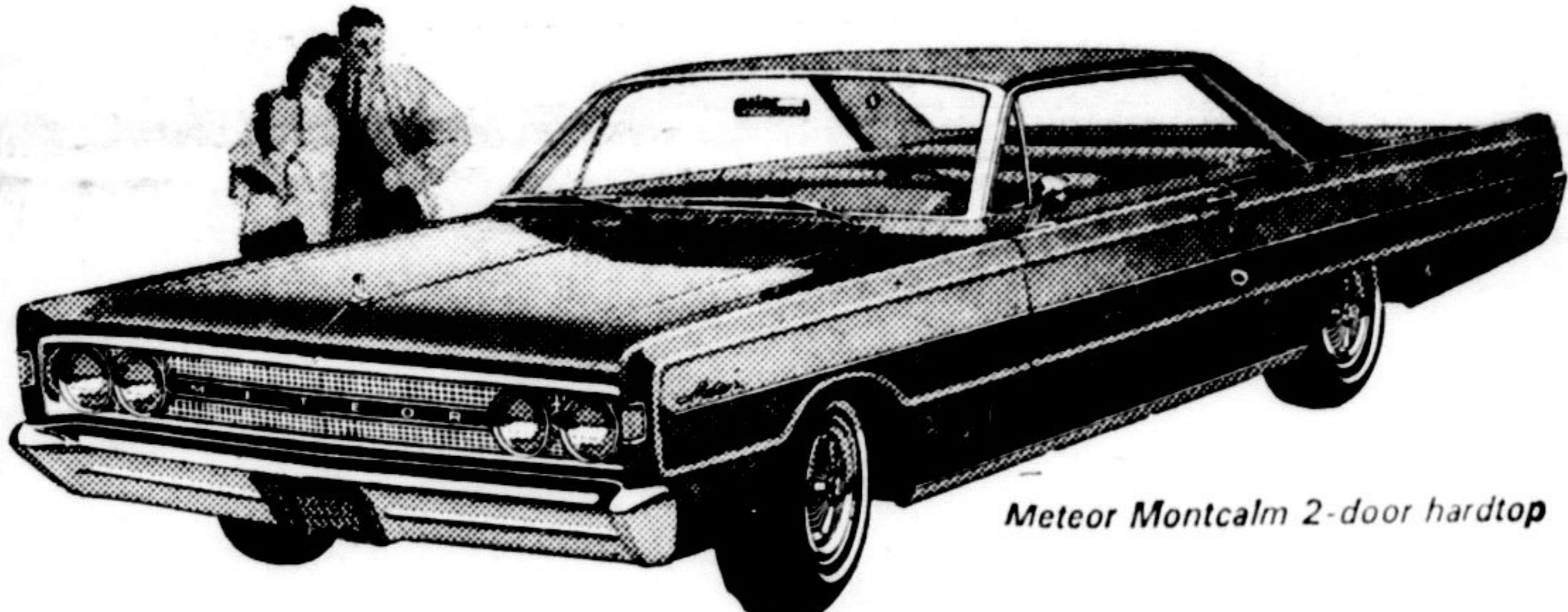
Meteor Montcalm 2-door hardtop

Never before have Meteor-Mercury dealers had such a great sales year. This increased volume means the biggest new car savings ever for you!