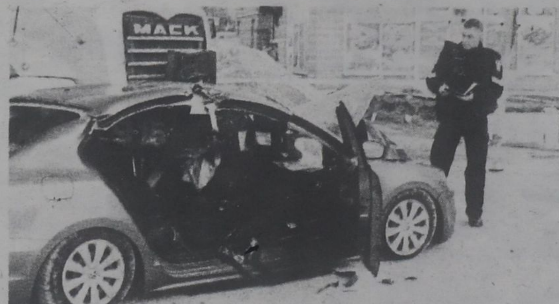
Halton Regional Police are investigating a serious crash on Nipissing Road in Milton Wednesday (Nov. 20) that has left a driver with severe injuries.