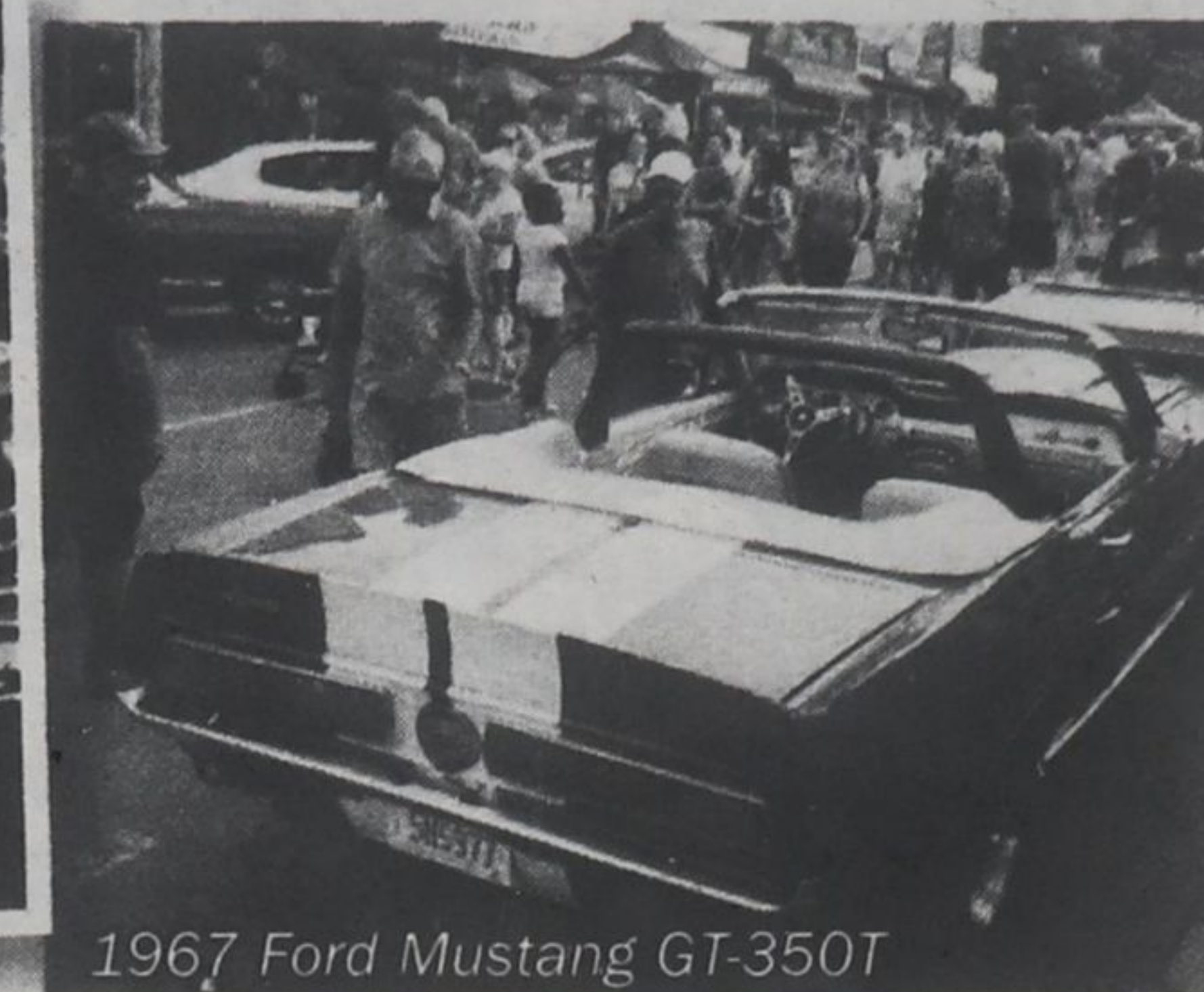
1967 Ford Mustang GT-350T

only event, Oakville's British Car Day is the largest of its kind in North America.