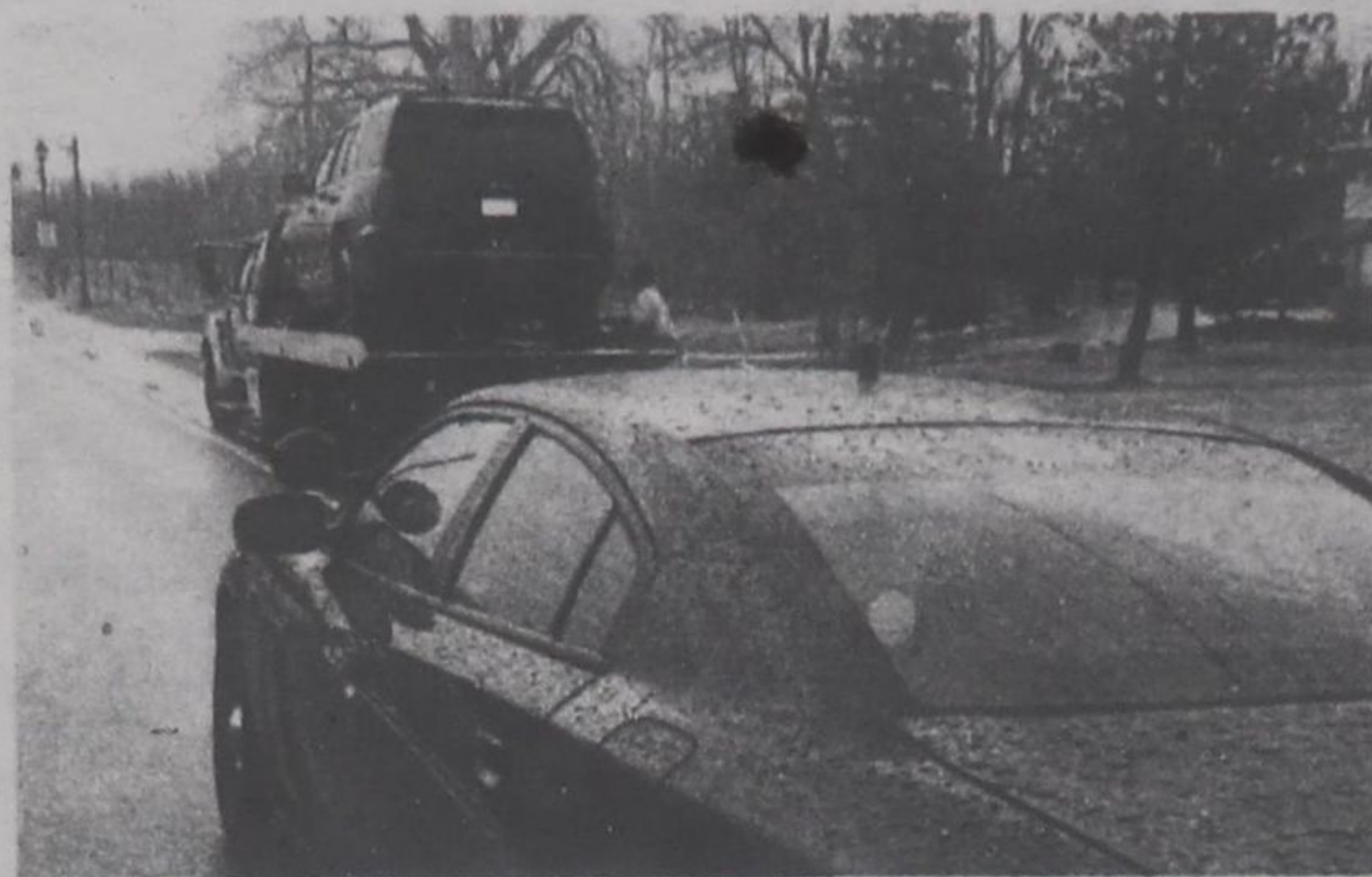
Halton Regional Police haul away this SUV after it was clocked at 112 km/h in a posted 60 km/h zone near Brookville School in Milton.

Halton Regional Police have charged a motorist with stunt driving and other offences after an SUV was caught speeding close to a Milton school the afternoon of Friday (April 12).