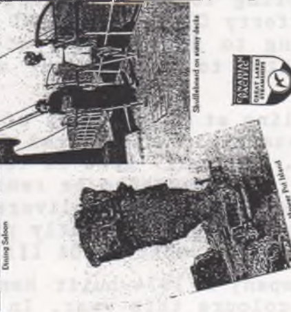
Shuffleboard on sunny deck