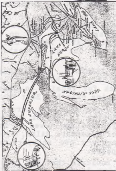
Route of the S.S. "Manitoba" Carefree Cruises