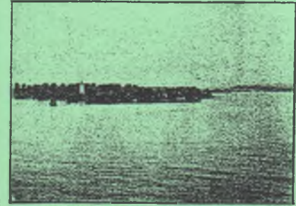
ROUND ISLAND, SAULT RIVER.