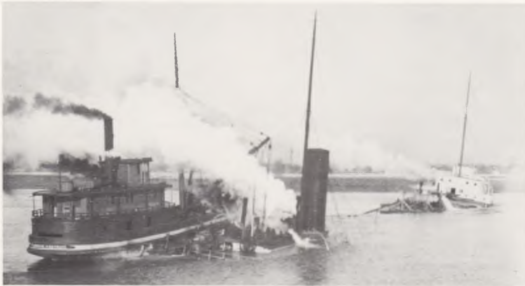
WILLIAM E. REIS lies sunk in the St. Clair River after her November 1, 1907 collision near Algonac. The wrecker T. W. SNOOK is assisting.