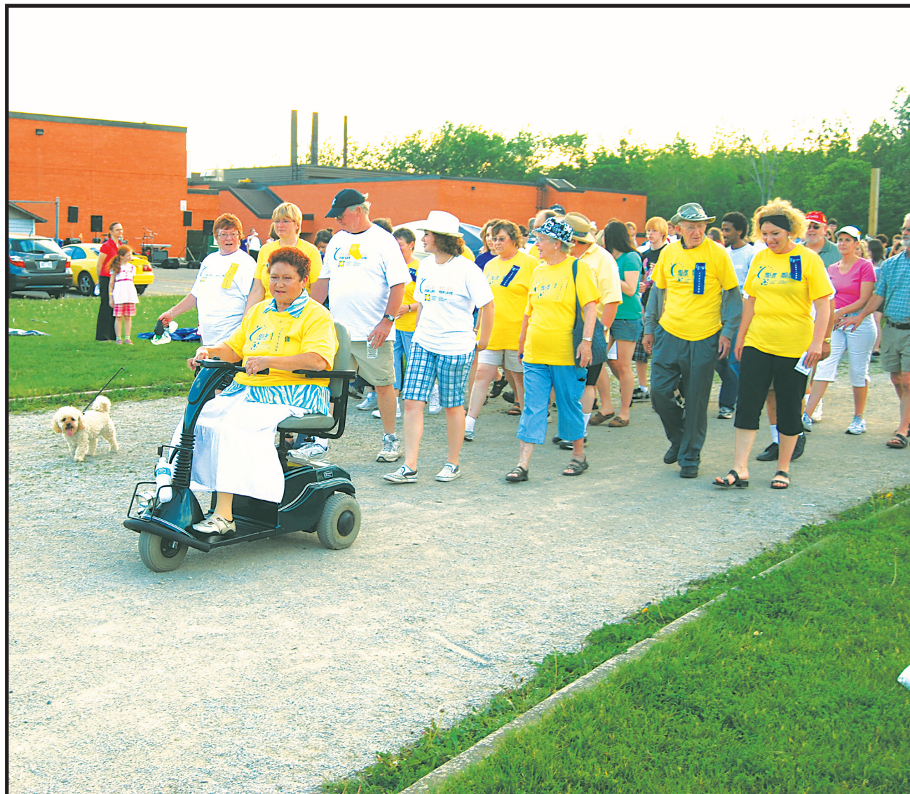
THE SURVIVORS WALK: Cancer survivors led their family, friends and students around the track for the first lap as part of the official opening ceremony of Acton High's Relay For Life Held over 24 hours between Friday and Saturday. This is the sixth year that Acton High hosted the event and to date they have raised almost $80,000 for Cancer research.