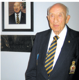
Legion honours long time member. See Page 18