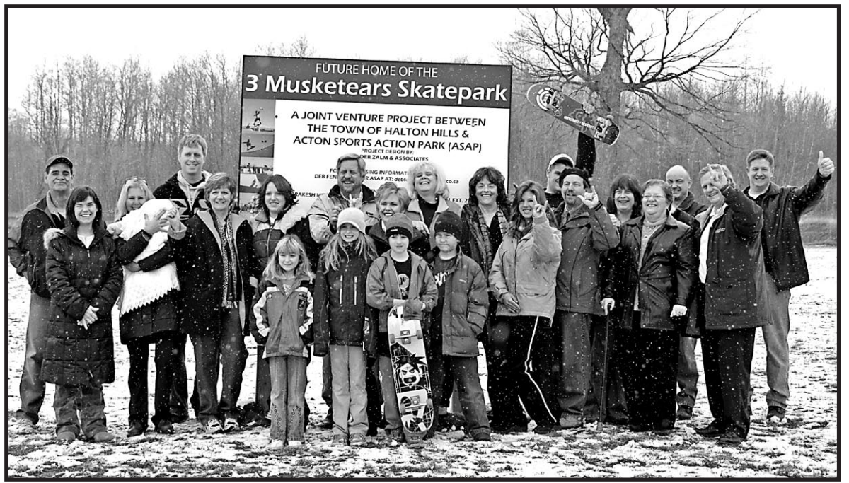
SIGN OF THE TIMES: A small but dedicated group of community members, Town staff and councillors gathered early Saturday morning beside the Acton Arena and Community Centre to unveil the sign for the "3 Musketeers Skateboard Park." After five years of hard work the Acton Sports Action Park (ASAP) committee is finally seeing their dream come to fruition with construction of the skateboard park set to begin in late summer.

glide over the ice like it was butter. Number 30 scored our only goal and it was a glorious sight to see. What was even better to see was how these kids, which I kept referring to as cute little things gave it their all and really enjoyed the game while their surrogate mom was in the top row yelling at the top of her lungs to "GO...GO...GO" as they skated towards the net.