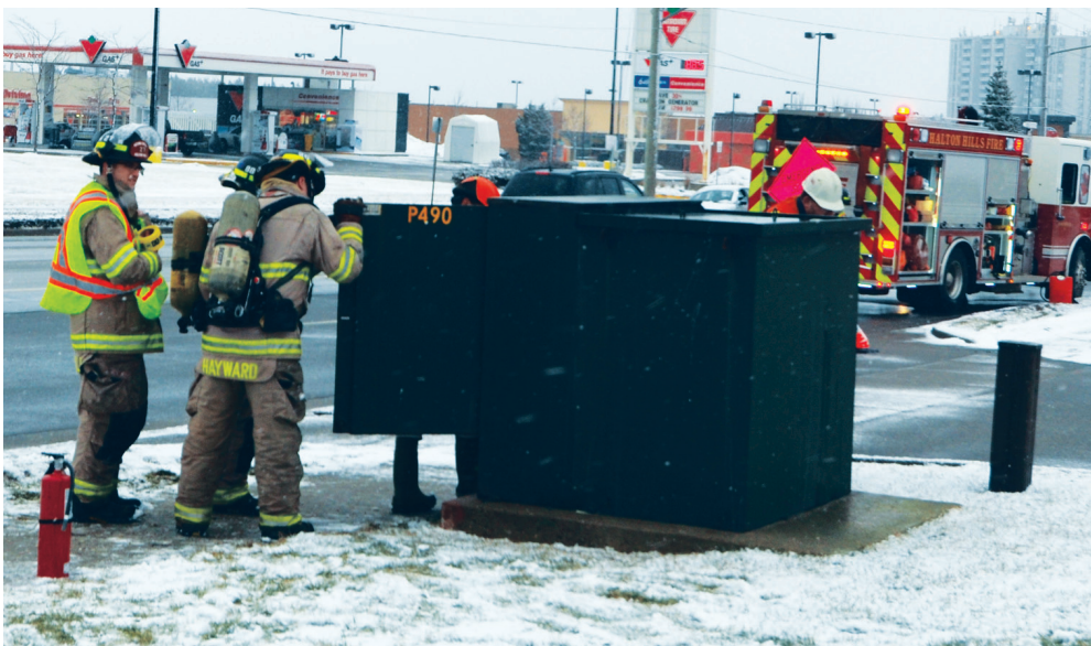
Crews from Halton Hills Hydro and the Halton Hills Fire Department worked to restore hydro in the area of Guelph St. and Sinclair Ave. Thursday afternoon (Jan. 28).