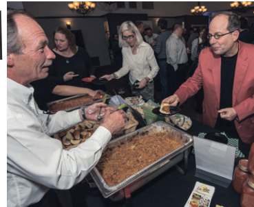
Good eats at Taste of the Hills Pg. 10