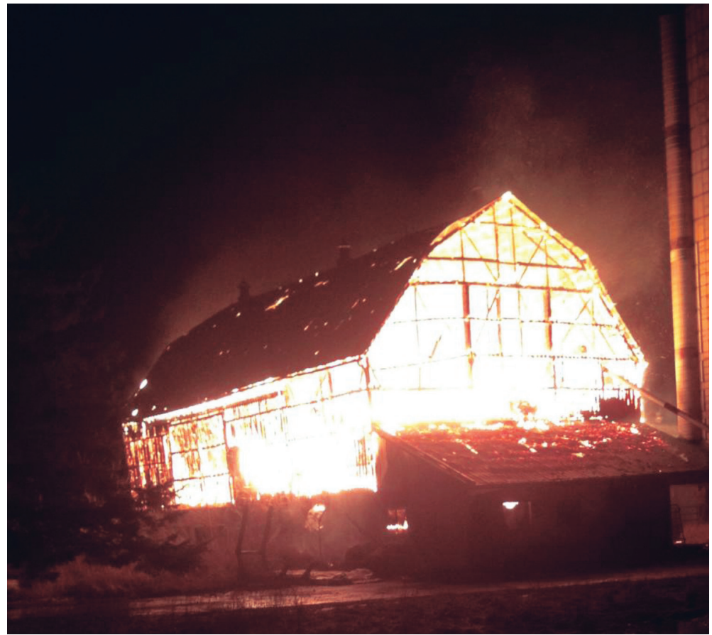
Halton Hills firefighters dealt with a fully involved barn blaze in cold temperatures Saturday morning at a property on the corner of Ninth Line and Five Sideroad. Left, the aftermath, firefighters were able to save a quonset hut and drive shed.