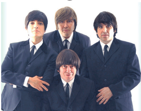
Beatlemania will take place Feb. 6 at 8 p.m. at the John Elliott Theatre.

In total, over 30 Beatles songs are performed live throughout the evening including "I Wanna Hold Your Hand," "Ticket to Ride," "Yesterday," "Penny Lane," "Help!" "A Hard Day's Night," "Yellow Submarine," "Eleanor Rigby," "Sgt. Peppers' Lonely Hearts Club Band" and of course "Hey Jude"