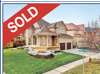
179 EATON STREET

OPEN HOUSE SUNDAY 2-4 PM 12 SERENITY STREET, GEORGETOWN