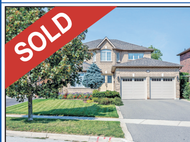
85 SAMUEL CRESCENT