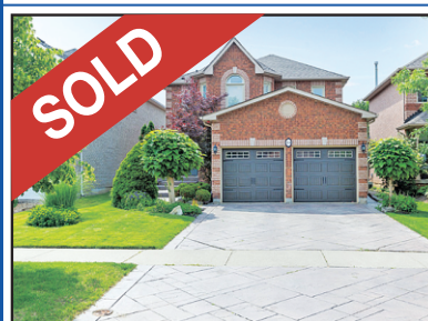
84 LAUCLIN CRESCENT