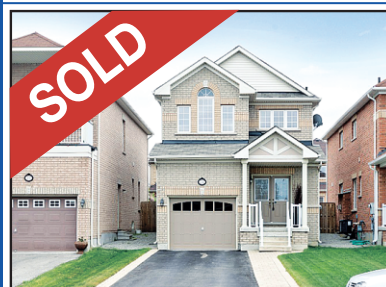
24 SERENITY STREET