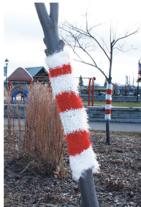
Tree trunks are candy-striped on Candy Cane Lane in Dominion Gardens. Watch out for the minions!

Participants have received sociological benefit as knitting and crocheting, once a solitary activity, have become a collective endeavour. The skills and creativity of many fiber artists working together were truly magnified in creating this installation. Our community stands to experience psychological rewards as people encounter the many detailed pieces. This initiative brightens the day