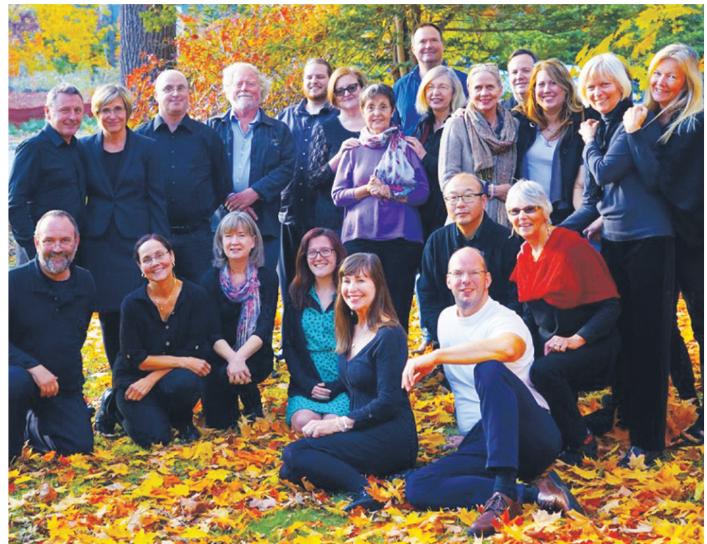
Members of the Georgetown Bach Chorale will perform Bach Advent Cantatas at St. John's United Church, 11 Guelph St., Georgetown on Saturday, Nov. 28 at 8 p.m.

Tickets $16-$27. Buy online at www.globe productions.ca or call the Box Office, 905-877-3700.