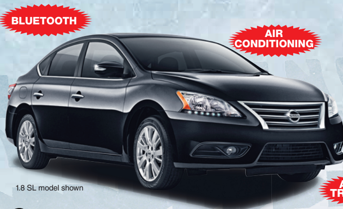
1.8 SL model shown