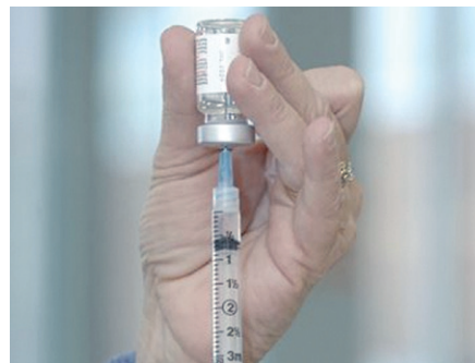
Halton Region is rolling out its influenza immunization community clinics across the region this month.

As Halton Region's Health Department (HRHD) begins to roll out its influenza immunization program, it's looking at making some changes given the recent data.