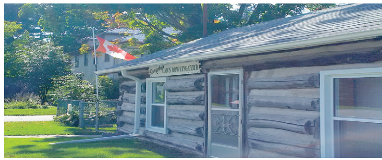
GEORGETOWN LAWN BOWLING CLUB

7870 Sixth Line S. (south of Steeles) The natural gas-fired plant uses state of the art low emissions technology to generate power for up to 600,000 homes. Outdoor industrial tour; wear walking shoes. Safety equipment may be provided. No children under 16, please.