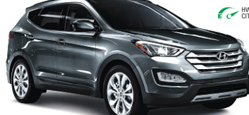
2.0T Limited model shown*