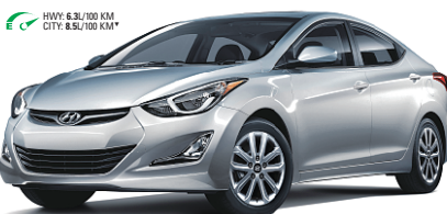
Sport Appearance Package model shown*