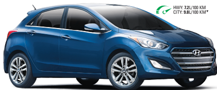
Limited model shown*