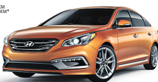
Sport 2.0T model shown*