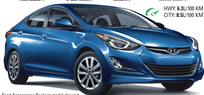
Sport Appearance Package model shown ♦