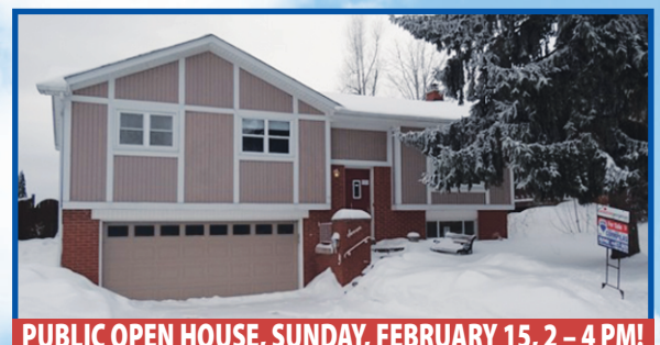
PUBLIC OPEN HOUSE, SUNDAY, FEBRUARY 15, 2 - 4 PM! 7 STOREY DR., ACTON $374,900